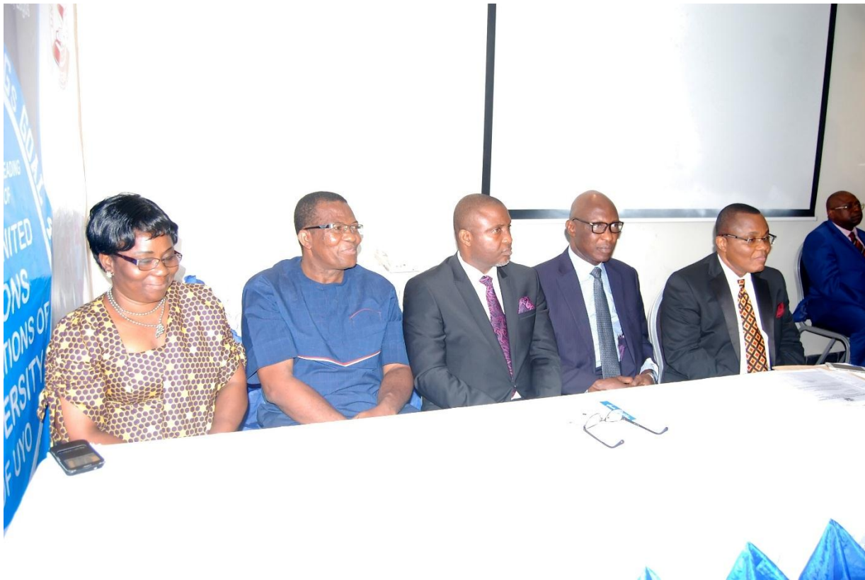
L-R: Librarian, Uniuyo; Director, Strategic Partnership & Liaison, SMEDAN; Registrar, Uniuyo; DVC, Uniuyo; Vice Chancellor, Uniuyo & Representative of the Honourable Minister of Education