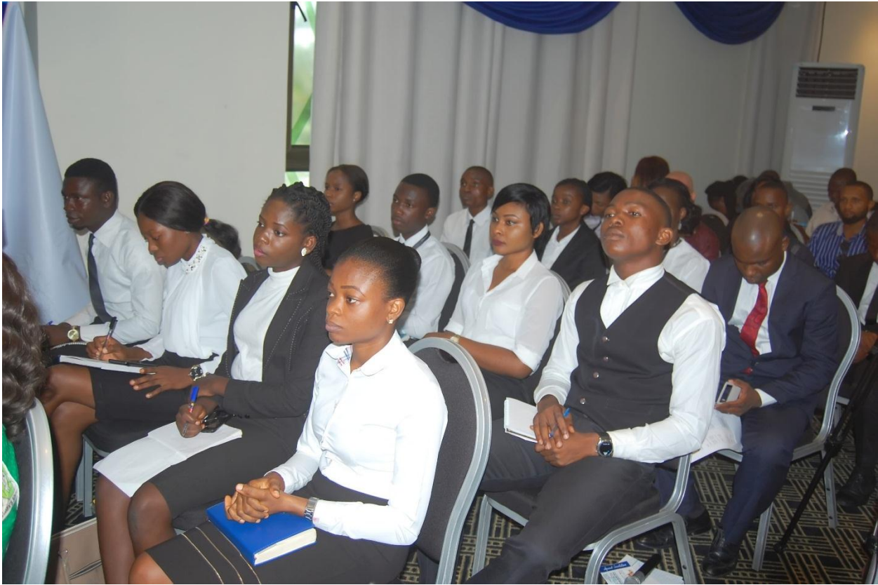
Cross section of students