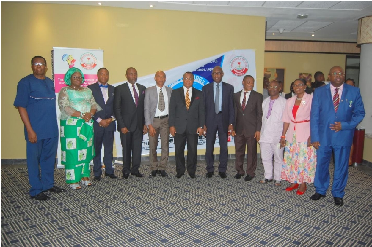
Group Photograph: AYM, Uniuyo, SMEDAN, NCWS, Uniuyo Alumni