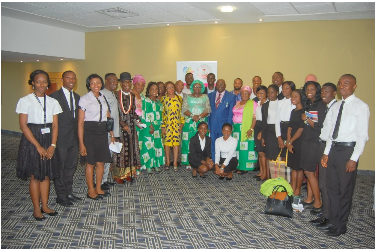
Group Photograph with members of Model UN Association of Uniuyo & Others