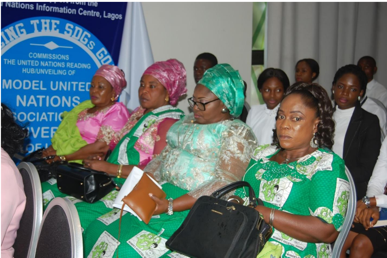
Cross section of National Council of Women Societies members